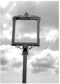
'the legend of jack sorrell' a book, November 2006