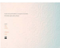
'jack sorrell research foundation' the web pages, January 2007