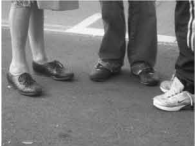
'what do you know about jack sorrell?' action research, October 2006

'jack sorrell research foundation' is a reflective ally for Efford.