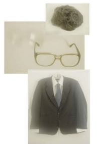
'jack look-a-like's?' one suit, January 2007 Plymouth Arts Centre