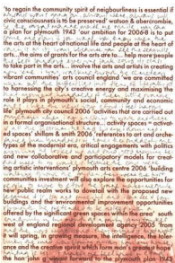
'jack says' four drawings, December 2006