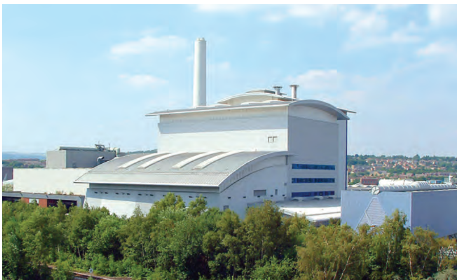
Veolia Environmental Services Energy from Waste facility in Sheffield

To do this, the plant must be equipped with technology which will limit the amount of polluting substances that are released. The facility must also be fitted with equipment which will monitor the gases released into the air and report the results to us. We will regularly check that the operator is meeting the conditions of the permit. If they do not keep to these conditions, we will take appropriate action against them to make sure they do.