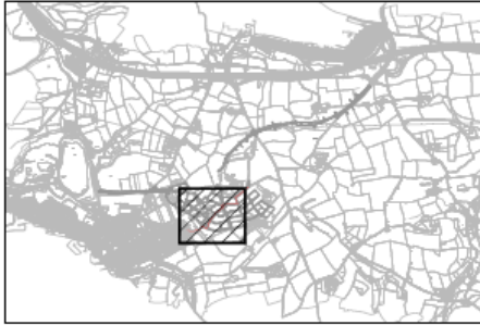
Context Plan NTS